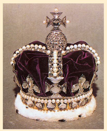
The fleur-de-lis (lily) also adorns most royal crowns. Here the crown of Queen Mary, consort of James II. She wore it at her coronation in 1685.

The badge of the Prince of Wales shows three silver ostrich feathers rising through a coronet of alternate Maltese crosses and fleurs-de-lis. The feathers and lilies are symbolic representations of the threefold flame. Beneath are the German words 'Ich dien' (I serve), assumed from the King of Bohemia in the 14th century. Interestingly, 'I serve' is the secret esoteric motto of Great Britain.